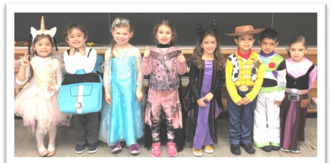
Casa Montessori in costume

I'm thankful for love and for God up above. I'm thankful for my friends and for fun that never ends. I'm thankful for school and for my family that is so cool. I'm thankful for my part in welcoming God in my heart. I'm thankful for my big brother And the meals made by my dad and mother. I'm thankful for the birds that sing I'm just so thankful for everything.