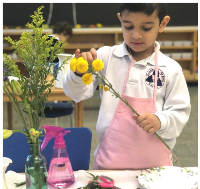
Arranging Flowers activity in the Casa classroom

With the weather changing please ensure that your child is dressed appropriately to go outside for recess. This includes snow pants and waterproof gloves or mittens so that your child can comfortably play in the snow. All outdoor clothing should be labeled with your child's initials. Parents are also reminded to update the change of clothes (in uniform colours) in their child's cubby as many children still have shorts and short-sleeved shirts to change into.