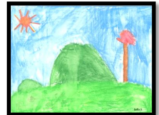
Above: Art by LEM students inspired by their visit to McMichael Art Gallery