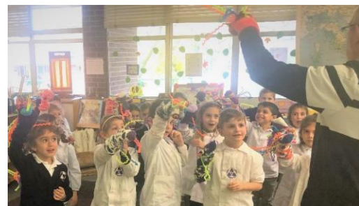
Preschool children enjoying a Puppet Making Workshop

This September, LDVA participated in our 15th annual Terry Fox Run to raise money for cancer research. This year students accepted a challenge to raise $5,000 for the Terry Fox Foundation, and we are so proud that we reached our goal, pushing our cumulative school total over the $50,000 mark. We would like to thank the LDVA Community of families and friends for the overwhelming support and commitment to achieving such an impressive total over the years. To celebrate our accomplishment, a special "Casual Dress Day" is planned for November.