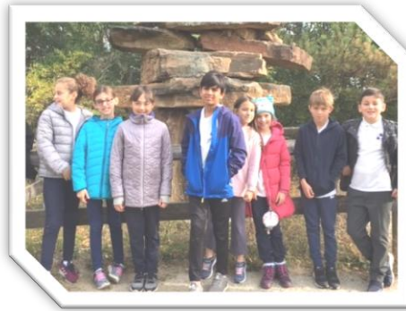
LDVA students at the McMichael Canadian Gallery in Kleinburg