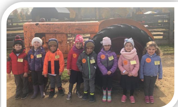
Casa Montessori at Downey's Farm