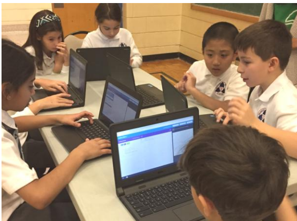
Students During The Coding Workshop

The Challenge reinforced speaking and listening proficiency and all 7 Da Vincian Principles - a great learning opportunity in communication skills.