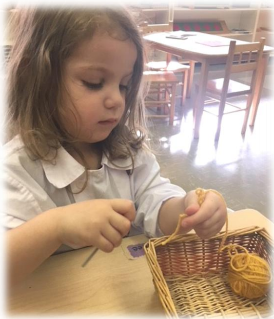
Hard at work in the Scuola Materna classroom

Everyone is asked to donate unwanted used clothing, clean clothes, soft toys, bedding, drapes, belts, purses and shoes (tied together). Items can be brought in any type of bag and dropped off in the gym on Thursday, December 7 or the morning of December 8.