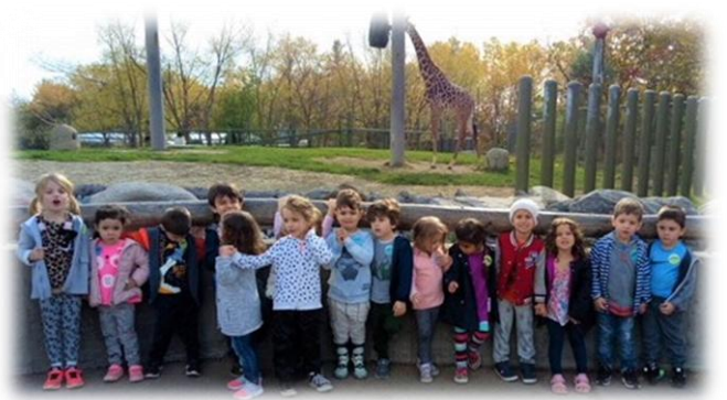
Above: Preschool students at the Toronto Zoo on October 23.

Our next fieldtrip will take place on Monday, Nov. 20 th when grades 1-6 will visit the Ontario Science Centre.