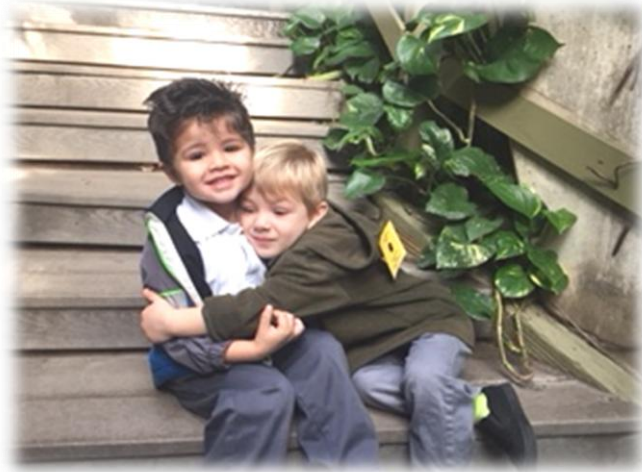
Junior Casa "buddies" at the Toronto Zoo

THANKS to all the parents for helping to make our school a great place to learn. Co-operation and parent support is essential for building a healthy and productive learning environment. The best support is the kind that reinforces school procedures, philosophy, and team spirit. Full co-operation with the school's uniform policy and arrival/dismissal procedures goes a long way to fostering a safe, efficient, and successful school experience for all.