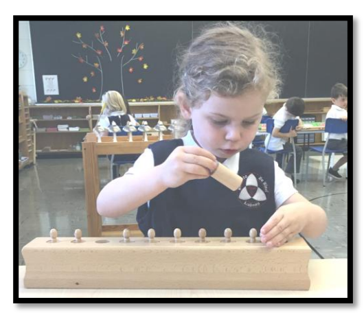
New Senior Casa student exploring the Cylindrical Blocks

Students and parents wishing to renew borrowed library books may do so online at <a href="http://www.tpl.toronto.on.ca/">http://www.tpl.toronto.on.ca/</a>. Please note that your child's library card number will be required to renew books on line. Students are advised to write their library card number in their planner. Students are responsible to turn in their library books as they enter the library during each visit. See Mrs. Lee for details.