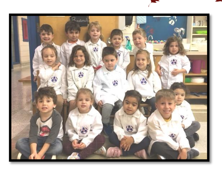
Scuola Materna Class - First Day of School