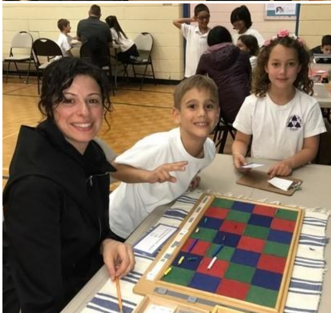
Students Teaching Mathematics to Parents