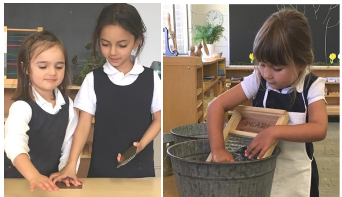
Casa Children working with the Decanomial Square (left) and engaged in Washing Linens activity (right)

We wish to thank the parents who have been bringing in flowers for the Arranging Flowers activity. The children have been busy decorating the classrooms with beautiful flower arrangements.