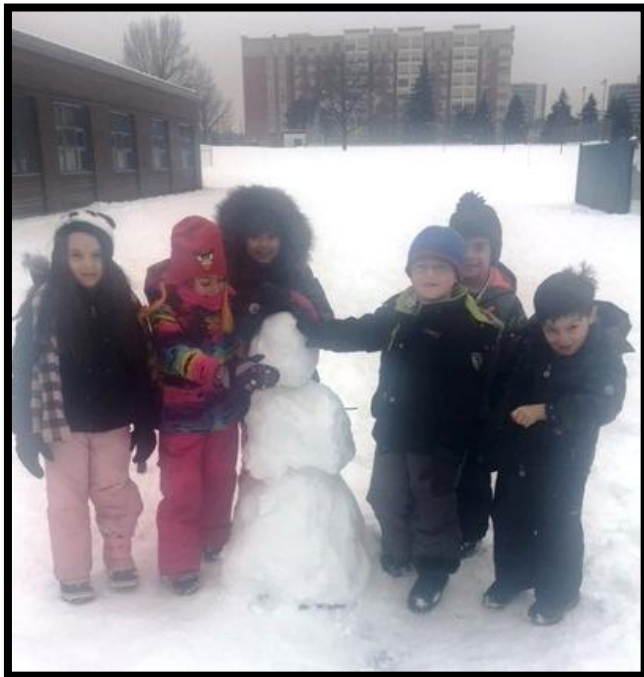
Scuola Children With Their "Pupazzo di Neve"