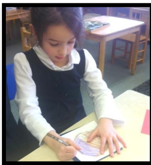
Junior Casa Children In Their Classroom