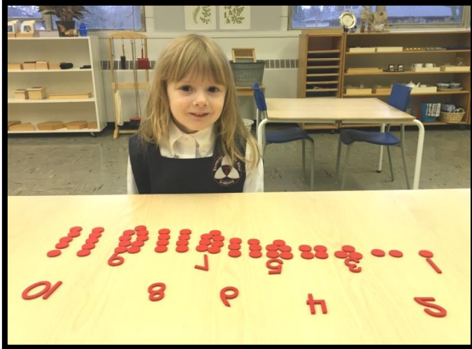
Senior Casa student working with numerals and counters