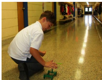
Launching Their Cars