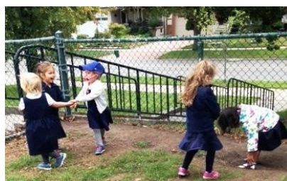
Junior Casa Children Enjoying Outdoor Recess on an Autumn Afternoon

Upcoming events in November: Mid-term progress reports will be sent home on November 4th; Remembrance Day assembly in the gym on November 11; Parent-Teacher Interviews will be held November 17-18th; November 24 is OPEN HOUSE at LDVA. Please tell your friends!