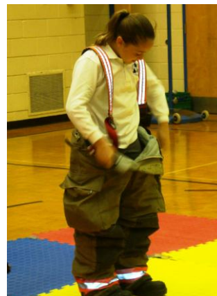
Learning About Fire Safety