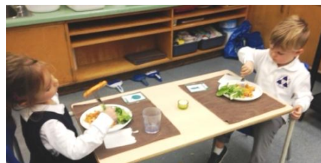
Lunchtime in the Junior Casa Classroom

Parent-Teacher Interviews are an occasion for parents and teachers to review objectives, share information, and to focus on the strategies for continued progress.