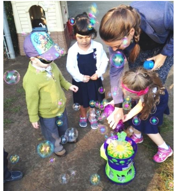
Fun With Bubbles