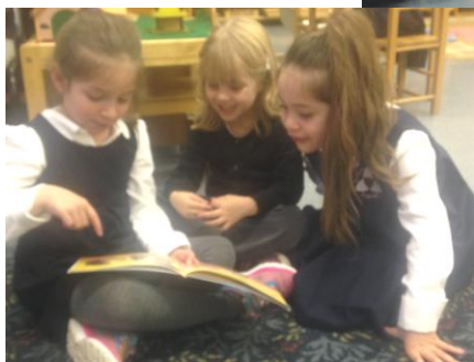
ABOVE: Casa Montessori children engaged in learning RIGHT: Students proudly wearing their creations