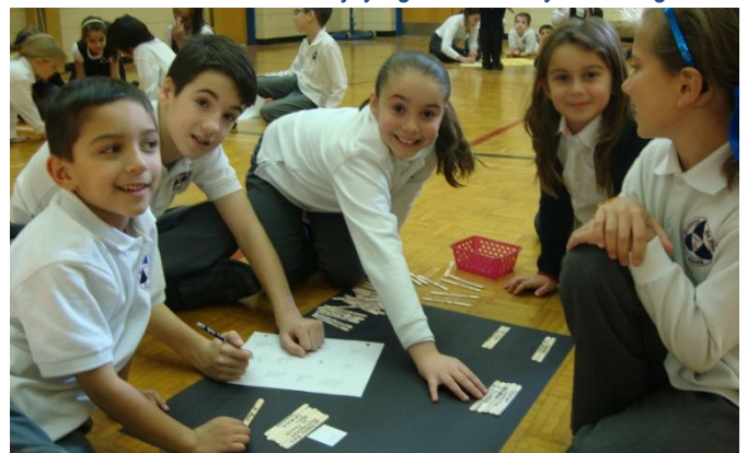
Below and Left: Students enjoying the January Challenge

During the formative years, Student Reports should be viewed mainly as an evaluation of the learning process. If used exclusively as a measure of student ability, Reports can actually be detrimental to learning. Using marks to motivate students is extrinsic motivation which is counter-productive to the kind of lifelong learning promoted by LDVA. The old carrot-and-stick idea of external rewards (extrinsic motivation) does not promote the development of creative and analytic skills. The best motivation for lifelong learning comes from within (intrinsic) and has three elements: autonomy, mastery and purpose . These are key elements of "Thinking Like Leonardo" and Montessori philosophies. Placing the focus on learning rather than on marks helps to nurture children's intrinsic motivation and best prepares them for the future.