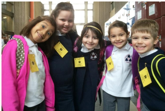
Above and Right: Casa children at the Ontario Science Centre