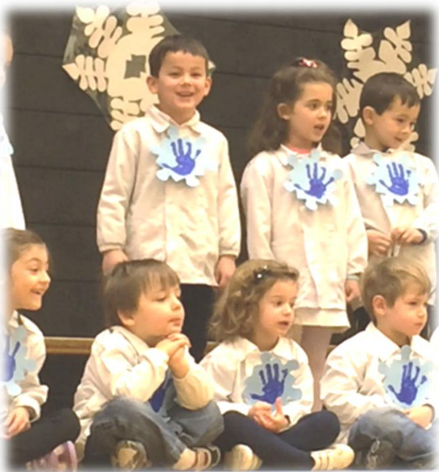
Scuola children on stage on Grandparents Day

On January 30, the LAPA Committee (above) organized a "Parents Night Out". The Parent Social was held at Cirillo's Culinary Academy. Thanks to all the parents that were able to attend. It was a fabulous evening with delicious food, great wine, lovely conversation, and some crazy photos. The night was fun for all, we especially enjoyed the past videos of the children that played on the screen throughout the night. Thank you to Coveted Cakes for donating the yummy cupcakes. The photo booth and Lindt chocolate treats were also donated by one of our LAPA families. We look forward to another successful event next year.